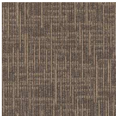
Liberty 8803 Brown